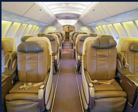
The size of our planes sets us apart, helping ensure your group's comfort.