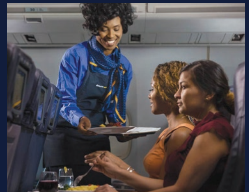
A dedicated team of specially trained flight attendants is used for our 747-400 VIP Plus flights.