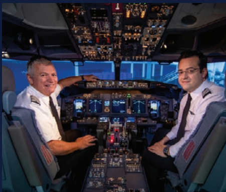
Safety is our top priority, with Atlas Air among aviation industry leaders.